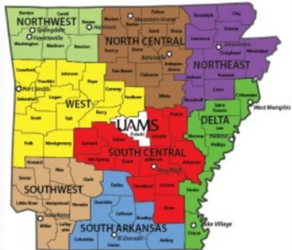
AREA HEALTH EDUCATION CENTER REGIONS